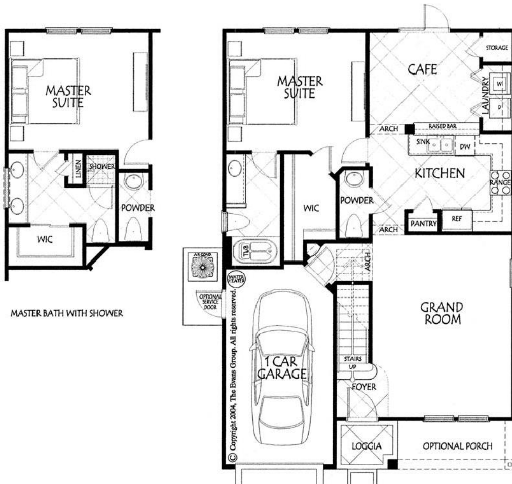
MASTER BATH WITH SHOWER

© Copyright 2004, The Evans Group. All rights reserved.